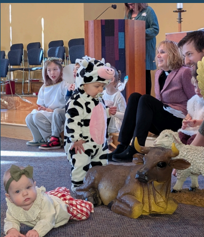
Intergenerational Christmas Pageant

Enjoy this wonderful season with family and friends!